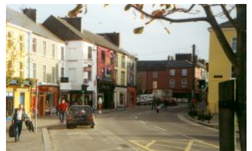
The Market Town of Listowel

Their work is celebrated in "Seanchai" – the Kerry Literary and Cultural Centre. "Seanchai" is a Gaelic word for storyteller.