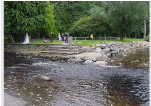
The Meeting of the Waters are just north of Avoca where the Rivers Avonmore and Avonbeg form the River Avoca