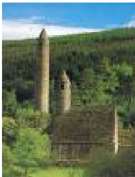
Glendalough Round Tower (7 th Century)

Glendalough Glen of Imaal Vale of Avoca Powerscourt Blessington Lakes Sally Gap Glemalure Waterfall Glenmacnass