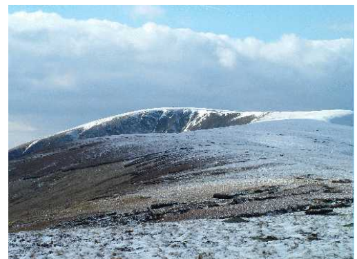
One of the Peaks Surrounding the Glen of Imaal is Lugnaquilla, known by climbers as "The Lug"

The Avoca River flows into the Irish Sea through the maritime town of Arklow, famous for its shipbuilding as well as for its pottery.